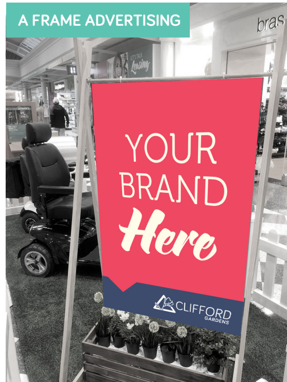
A FRAME ADVERTISING